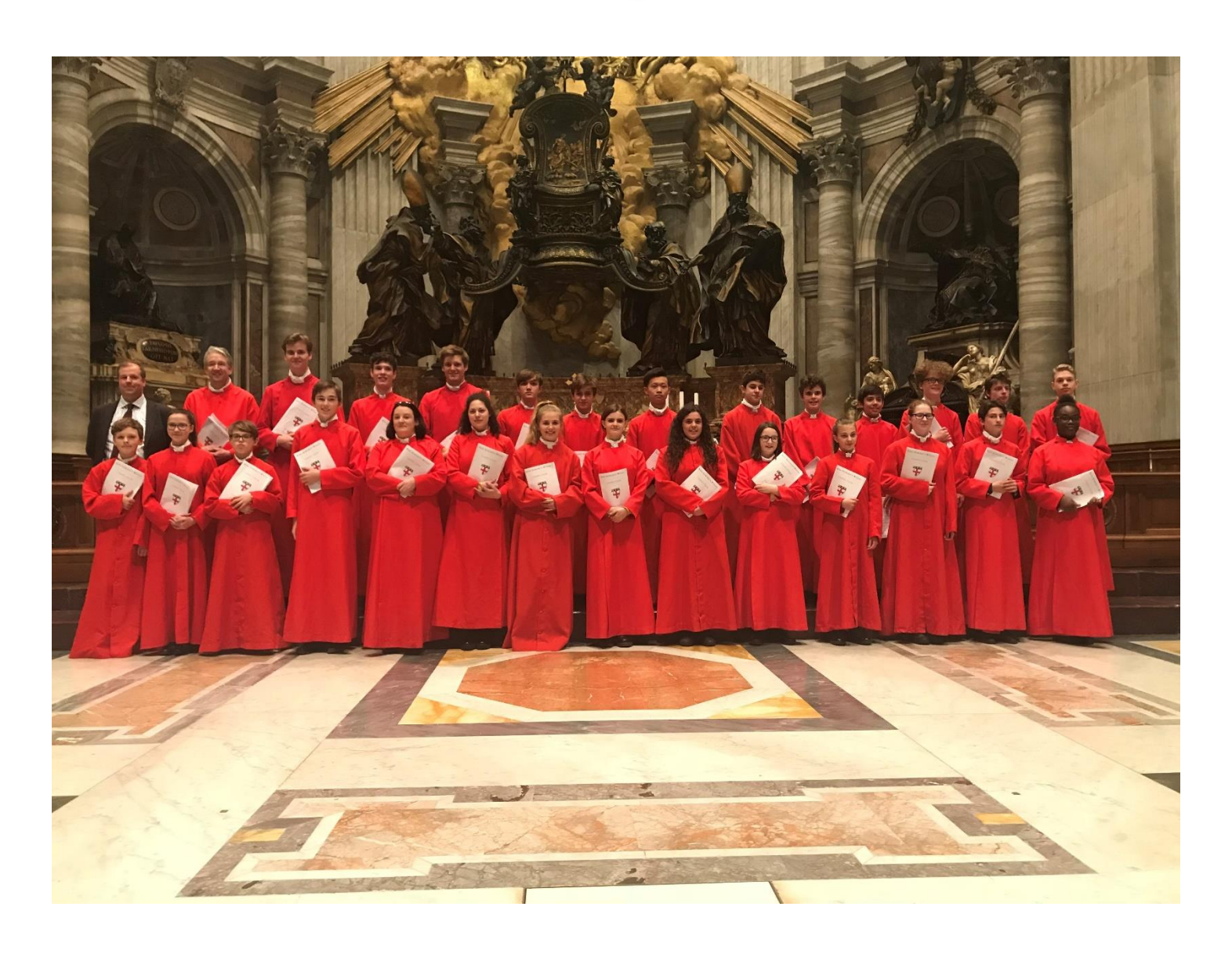
King Edward's Choral Services 2019-20