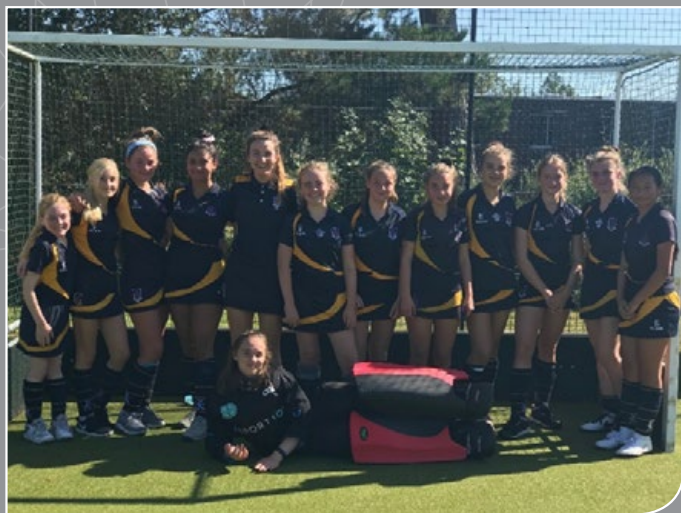
GIRLS' HOCKEY 2019