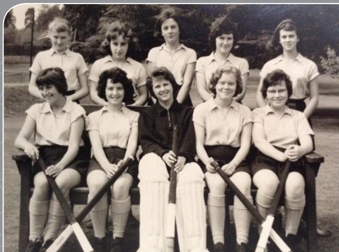
GIRLS' HOCKEY 1960